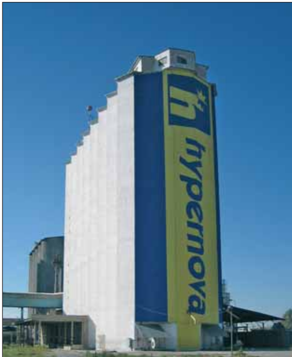
Successfully renovated and restored – a grain silo plant in a former swamp area of Rimavska Sobota, Slowakei.

Since a large portion of the surrounding land contained a buried concrete slab, waterproofing the building for the outside was not an option. The solution for the water problem would have to be addressed from the inside. In order to achieve the targeted "Dry Situation", a new strategy and tough process was used to find the proper combination of products with specialized characteristics.