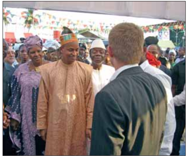
Honored guests at the AQUAFIN International GmbH booth (pictured from L to R): Genes Saran, Minister for Economics and Medium-Size Enterprises, Cellu Dalein Diallo, Prime Minister and Foro Mu, Minister for Building in Guinea.