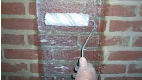
Typical application of ASOLIN-SFC45 to a brick façade with a roller.

ASOLIN-SFC45 is the newest addition to the Building Repair Materials product line from SCHOMBURG. It is a ready-to-use siloxane based cream façade impregnator.