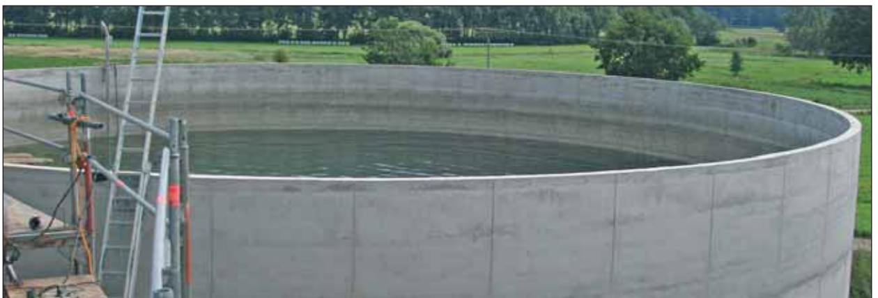
Agricultural water tank waterproofed solely with AQUAFIN®-IC ADMIX.