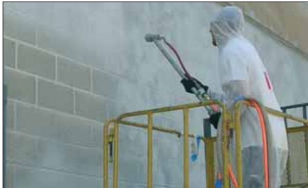
Typical spray application of AQUAFIN®-TC07.

On the basis of the AQUAFIN technology SCHOMBURG's research & development team created a new waterproof,