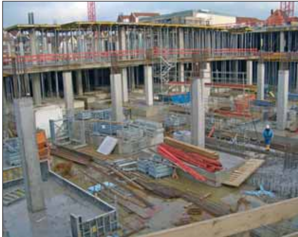
Large construction site where DURORETARD V.3.01 has been installed successfully.

Current superplasticizers for concrete – independent of the generation and raw material base – work mainly by the mechanisms "dispersion" or "steric repulsion", whereby the latter one is under discussion, because it can only hardly be proved – or not at all.