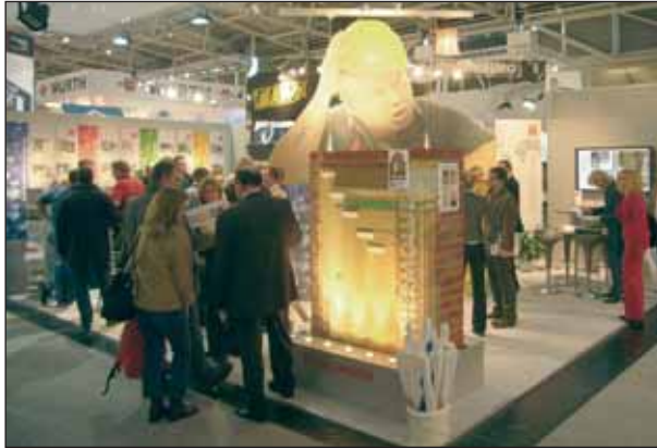
The new THERMOLUT® system at our booth during the BAU 2007 in Munich peaked the curiosity of many visitors!

What makes SCHOMBURG likeable? Many of our important visitors at our booth during the BAU 2007 told us: first of all our comprehensive line of high quality product, our vast understanding and knowledge of the construction and restoration market, highly knowledgeable and helpful technical support employees and all-in-all the complete marketing package that SCHOMBURG presents.