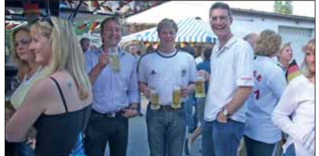
Germany's success in the opening games wasn't the only reason to be in good spirits.