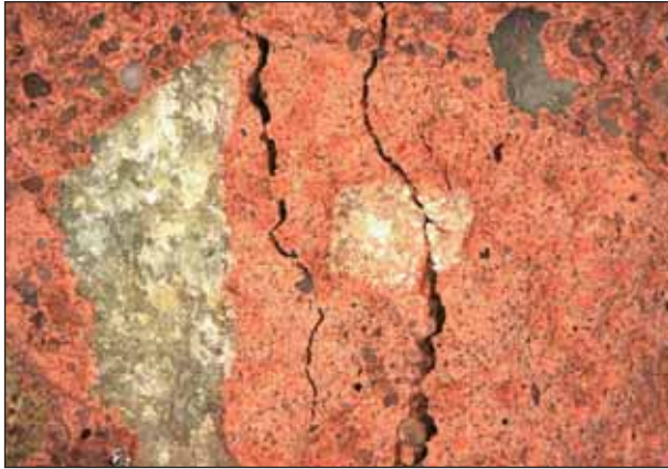
AQUAFIN®-IC ADMIX in pigmented concrete before water submersion. (magnified 16 times)