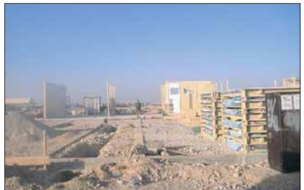
Approximately 3,000 m 2 of INDUTEC flooring product were successfully installed at the German Federal Armed Forces base in Afghanistan.