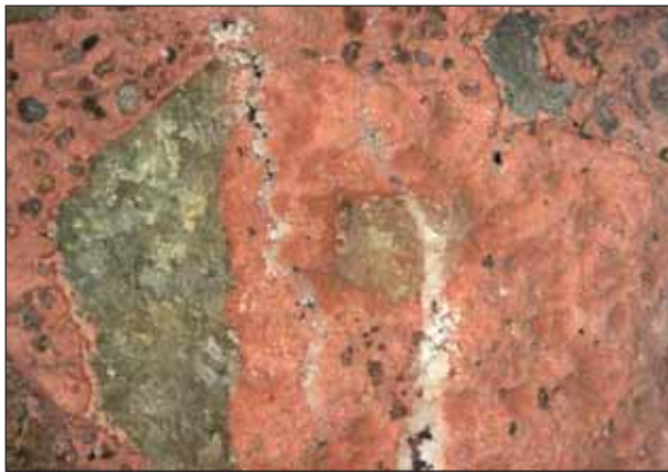
AQUAFIN®-IC ADMIX in pigmented concrete 21 days after full water submersion. (magnified 16 times)